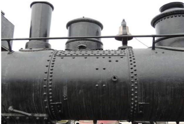
White-Pass Railway Tram Car, 1898-1900