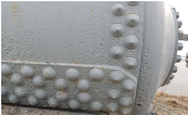
Yukon River Steamer "Canadian" Steam Engine Boiler