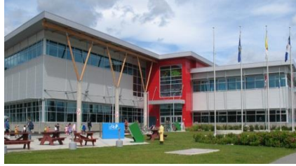
Canada Games Centre 200 Hamilton Blvd

The activation of an alternate reception center will be determined by the EOC based on the location and nature of the emergency or disaster and in consultation with the Incident Commander. Certain assembly areas may be used as reception centers where an agreement is in place.